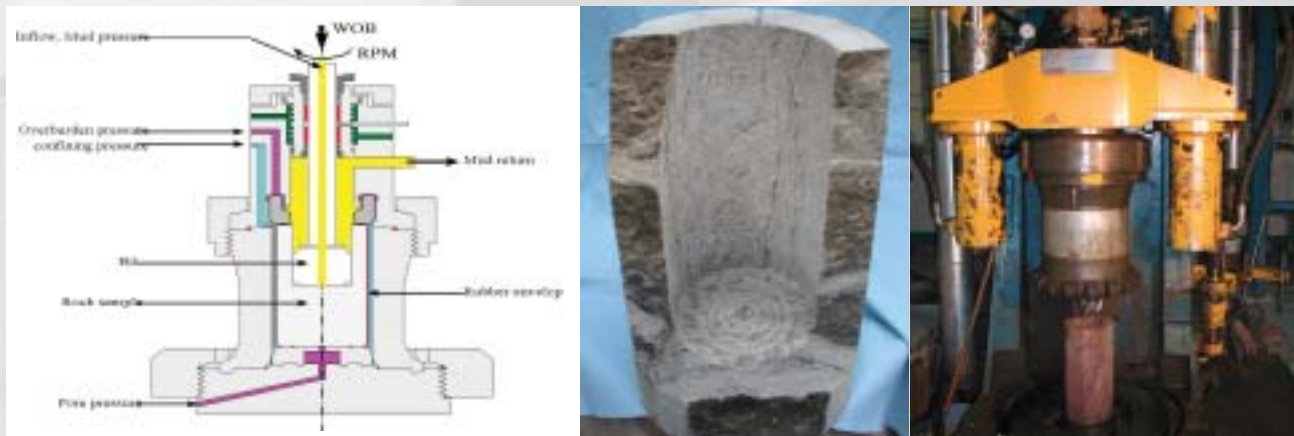
Principle of the DTF

Characterization of drilling behavior of any type of full scale drilling bits can be done in only few days. The Drilling Test Facility is able to test roller cone or fixed cutter bits up to 8"1/2 in diameter and simulates the deep hole drilling conditions. The tests consist of drilling rock sample under constant WOB or constant ROP. The rock was held in a pressure vessel and after the test, the bit and the bottom hole pattern can be examined immediately.