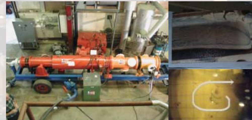
Hydraulic Bench Facility